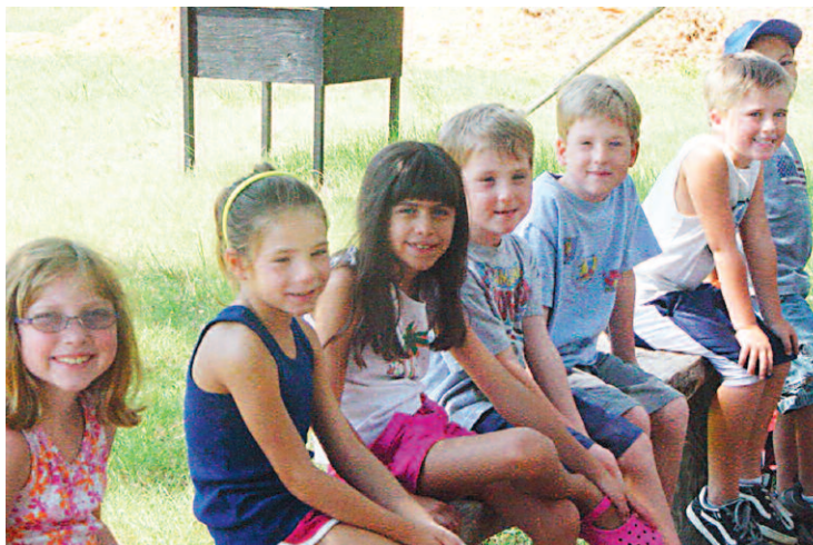
The abbreviated "Taste of Camp" experience is a popular way to let Arrowhead's youngest campers "test drive" camp life.

The process involved examining Camp Arrowhead's operations to ensure we met the standards set by the ACA. It culminated this past summer